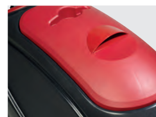
Simplified cleaning of the recovery tank, thanks to a large tank cover