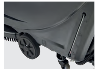
Easy to maneuver and transport: Big wheels and strong casters, making the machine well-balanced