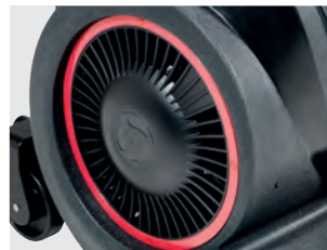
High quality air fan with filter protection