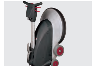
Space-saving storage in upright position. Large transport wheels for easy transport