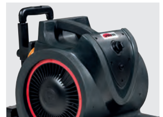
Handle for lightweight transportation