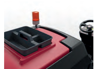
Easy-access debris tray