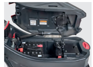
Recovery tank with hand grip for easy tilting