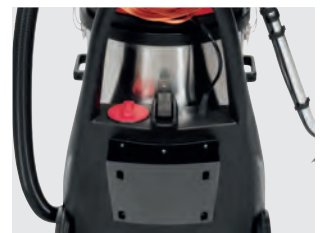
Fresh water tank integrated in the chassis.