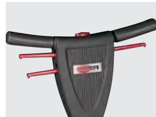
Ergonomically designed handle with height adjustment, center type safety switch and easy to use function lever