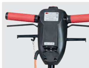
Ergonomic handle with height adjustment, safety switch and control lever for detergent tank