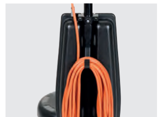
Robust metal hook for safe winding of the power cord and receiving the Leaves Ellers as storage