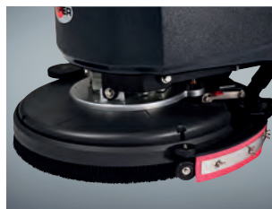
Tool-free removal and assembly of squeegee simplifies maintenance