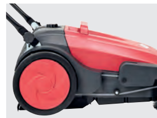
Large non marking wheel