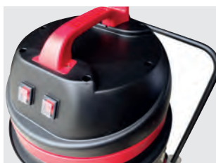
Easy handling due to ergonomic handle with cable hook and two separate on / off button