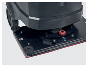
Orbital scrubber for floor cleaning or coat stripping (AS7190TO)