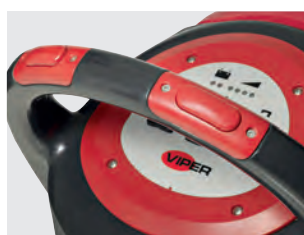
Ergonomically integrated safety switch. Each switch can be operated independently