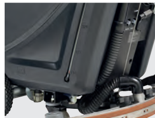
Water level indicator with volume visible on the tank