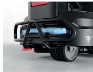
Sturdy bumper with high-visibility lights