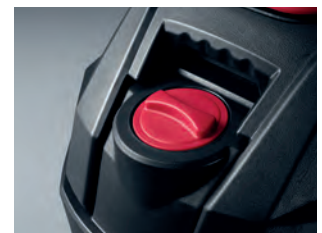
Convenient front access to solution tank for quick refills