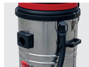
Drain hose for easy emptying of the container