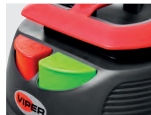
ECO button to adjust the suction power and reduce the noise