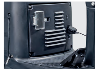
An integrated on-board charger enables easy plug-in and battery charge at any outlet