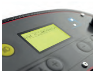
LCD heads-up display incl. hour meter