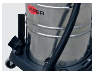
Easy storage of accessories