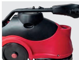
Foldable handle for easy storage