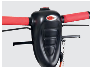
Ergonomic handle, adjustable in height, central safety button, control lever for detergent tank