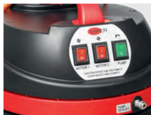
One-touch function elements for easy operation