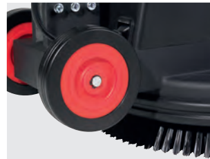
Large rear wheels facilitate transport and ensure good maneuverability