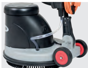
Powerful, rugged engine and large rear wheels for easy transport