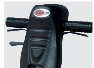
Ergonomically designed on handle and controls