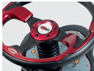
Intuitive dashboard, one touch button and userfriendly menu for operation settings