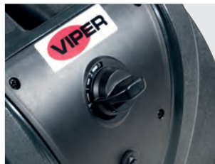
3-speed induction motor with reduced power consumption