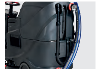
Built-in squeegee hanging system on recovery tank for easy machine transfer in narrow areas