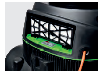
HEPA filter comes as standard