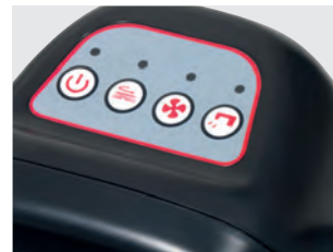
Easy to use control panel with four main functions