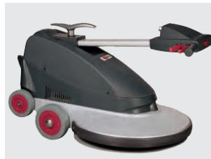
Folding handle for easy, space-saving storage and transportation of the vehicle