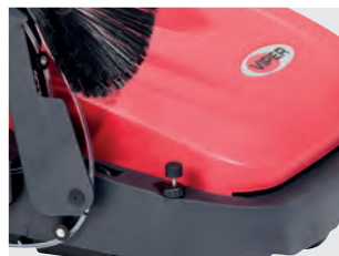
Side brooms can individual be adjusted just by turning a knob