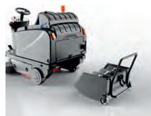
Wheeled hopper with optional mini containers