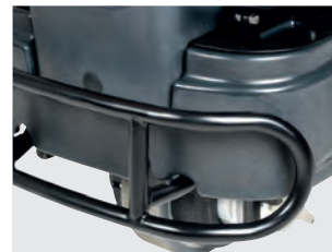
Standard front bumper protects the machine for longer life-time