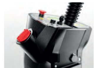
Remove the red cap and fill the solution tank with fresh water