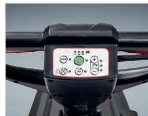
Intuitive control panel provides control over all functions (AS4325 model)