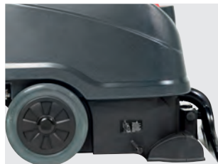
Large wheels for easy transport and maneuverability