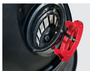
Water filling through large oval opening with filter and protective cover