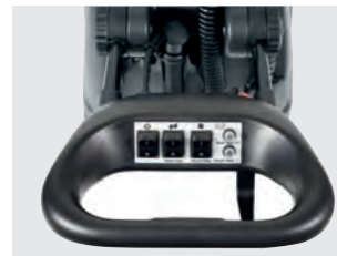
Ergonomic and adjustable handle