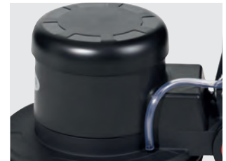
Triple planetary gear and quiet motor and gears