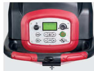
Intuitive control panel with LCD screen for all models (AS6690T/AS7690T pictured)