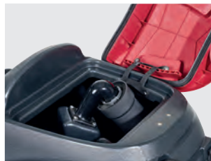
Large opening to the 73 liter recovery tank allows easy cleaning