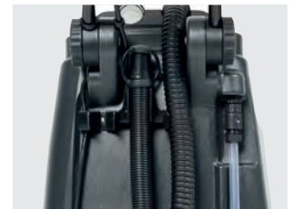
Drain hose for easy emptying