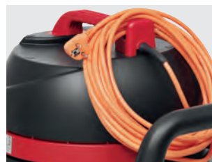
Cable holder for easy storage