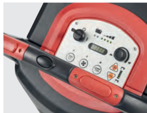
Control panel with intuitive display and buttons