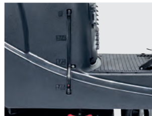
Water solution level indicator with volume visible on the tank