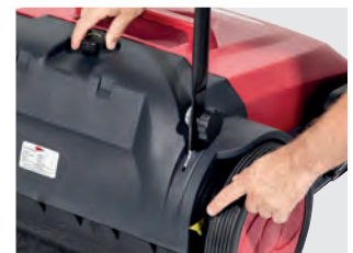
Adjustable main brush