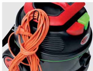
Cable holder for easy storage