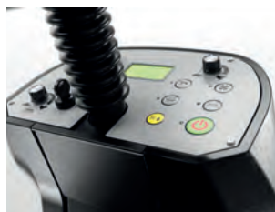
One touch start activates all main functions