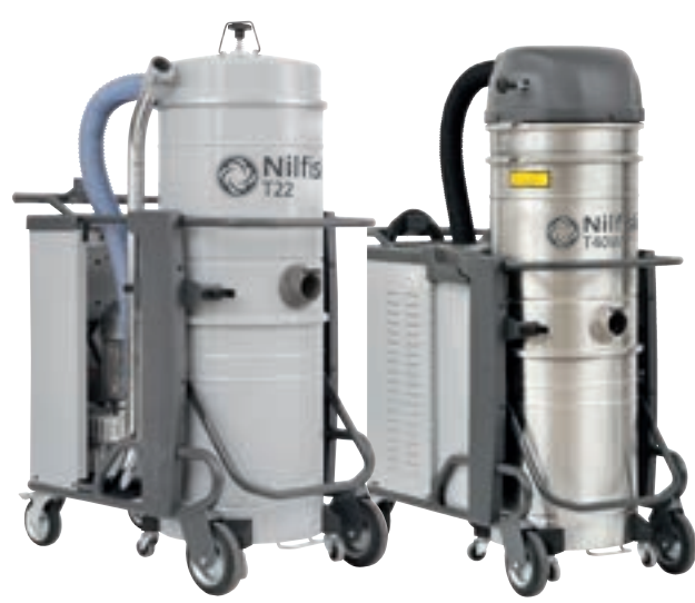
TMinus & TPlus series