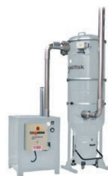
Centralized vacuum systems