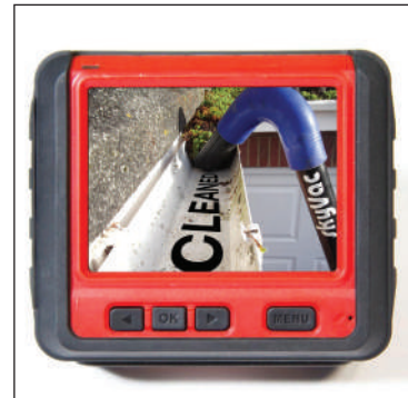
See into every corner