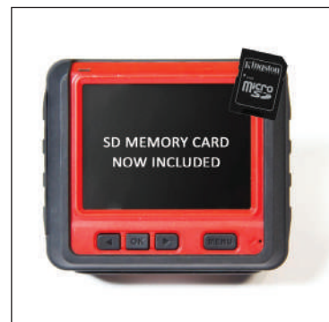
SD memory card now included