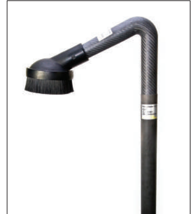
Carbon Fibre Tool Holders