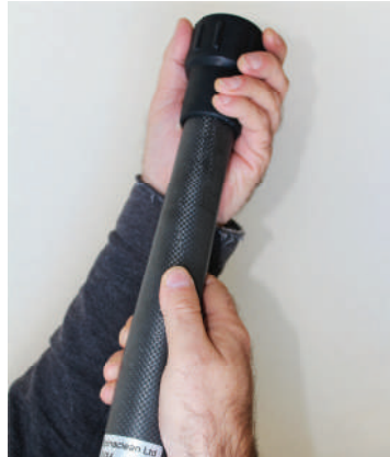
Carbon Fibre Hose Cuff Connector