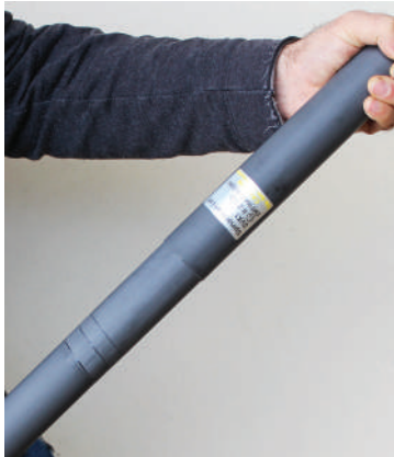
Clip free, rapid pole connecting