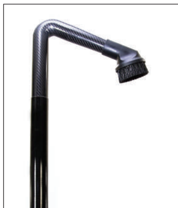
Carbon Fibre Hose Cuff Connector