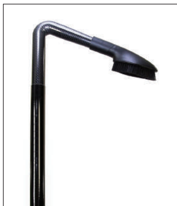
Clip free, rapid pole connecting