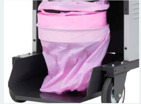
Longopac is available in standard and antistatic version