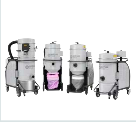
Available models in L-M-H class, in ATEX version, with Longopac or cartridges... and many more.