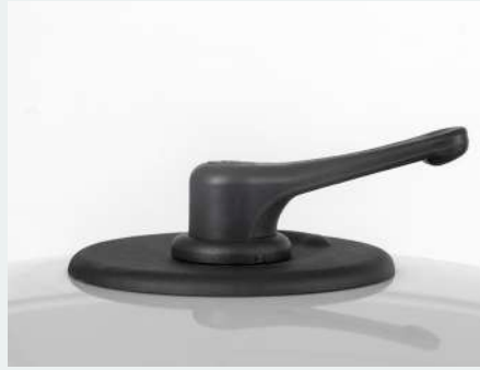
Manual filter shaker