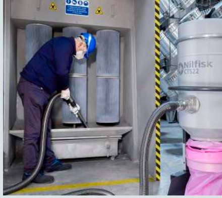
Recovery of very fine dust in coating industry.