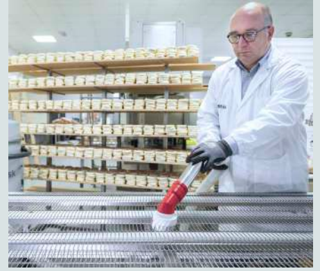
Cleaning of production line in food industry.