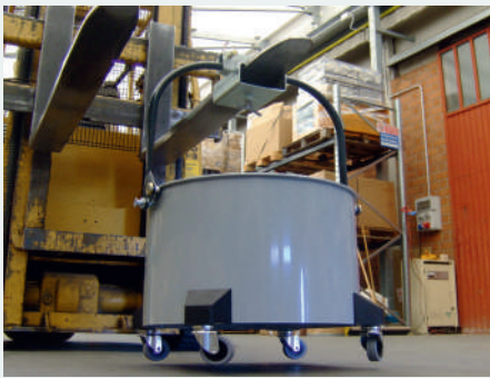
Container transport and discharge system with lift truck