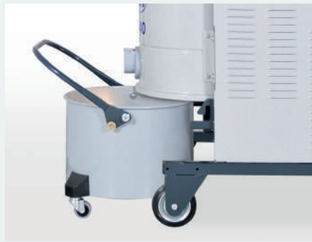
Container release system