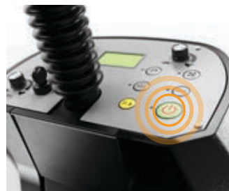
One touch start activates all main functions