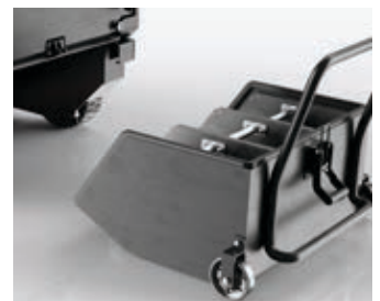
Wheeled hopper with optional mini containers